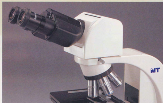
MA957 ERGONOMIC TILTING BINOCULAR HEAD (SIEDENTOPF TYPE)