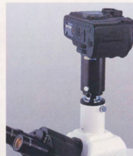
MA150/50 Camera attachment