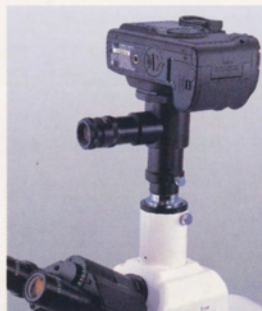
MA150/60 Camera attachment

These attachments are used to mount the camera with T2 adapter ring to the photo tube.