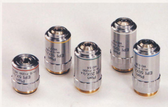
PLAN EPI OBJECTIVES