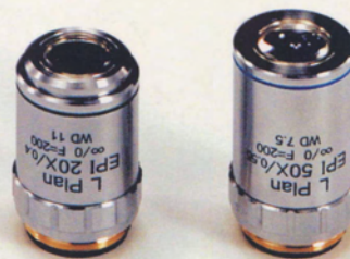
LWD (LONG WORKING DISTANCE) PLAN EPI OBJECTIVES